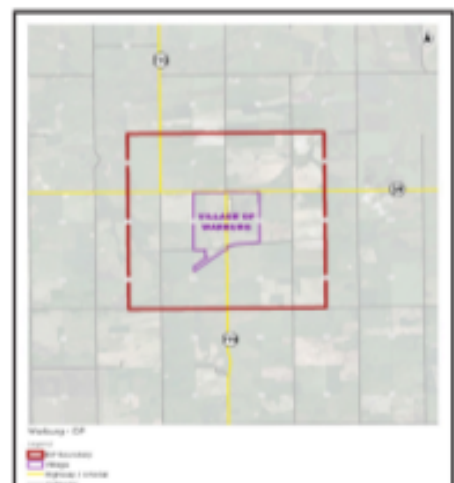
Map showing the IDP boundary between Leduc County and Warburg.

IDPs ensure that desired long-term growth and development looking beyond 20+ years is not compromised by land use and development decisions made today or by future municipal councils. It also provides assurance to residents that live within the Plan area of future development plans. Both municipalities must agree to the policy direction put forward in the IDP and both municipalities must abide by the IDP. The IDP includes a dispute resolution process for disagreements on whether proposed land use and development proposals are consistent with the agreed to policies in the IDP.