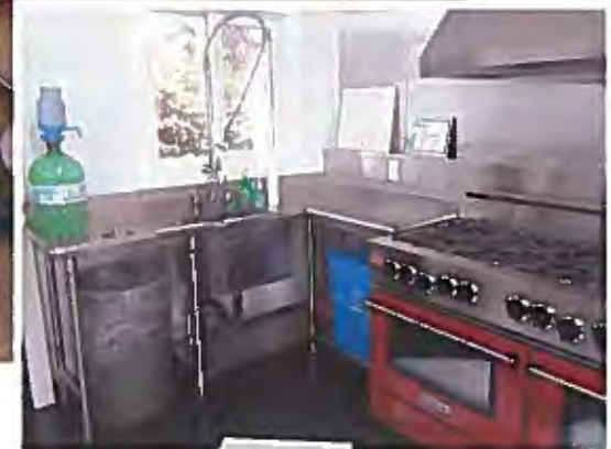
Warburg Cultural Centre Open House

Wine Tastings: $35 per person or $180 per person for season's tickets